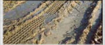
EARTH AND MUD